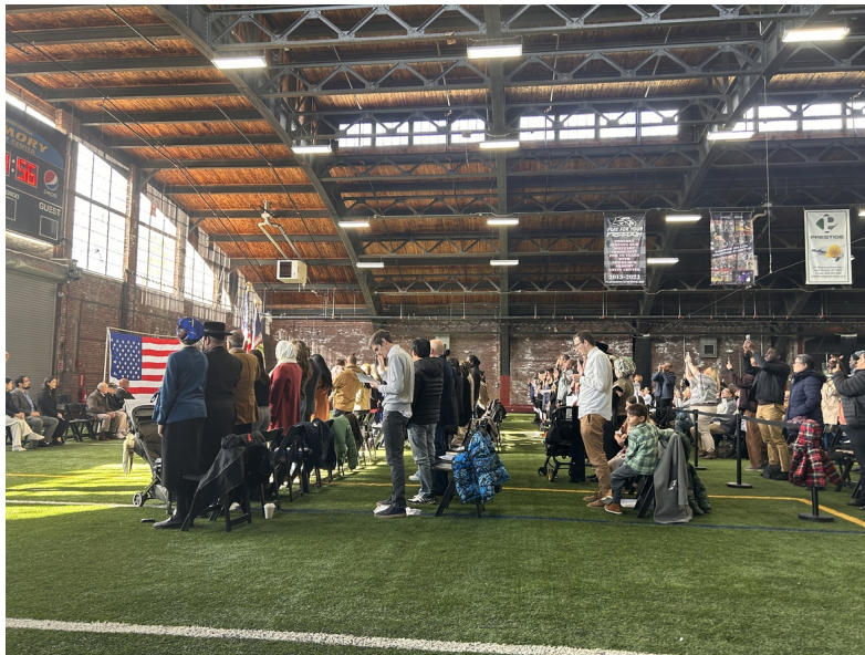
Newburgh Armory Naturalization Ceremony 2023