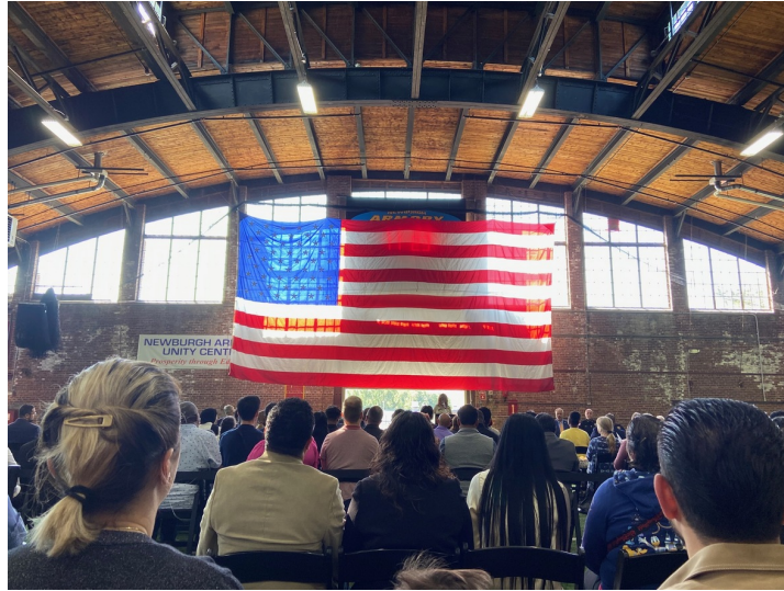
Newburgh Armory Naturalization Ceremony 2023

Many LWV members and friends volunteered to make these events a success. Thanks to all of you!