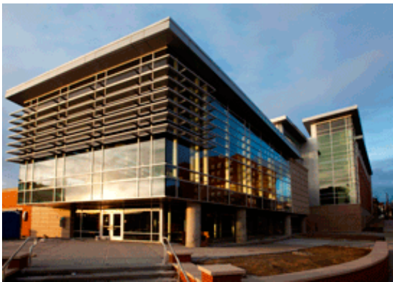
SUNY Orange Newburgh

At the conclusion all were very pleased with the outcome and we requested that any student organizations on campus that would like to continue registration efforts get in touch with us. We really hope to establish an ongoing interest in democracy as we move into 2024"