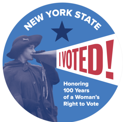
Sticker produced for the 2018 mid-terms