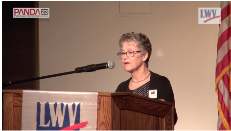
Dare facilitating a Candidate Forum