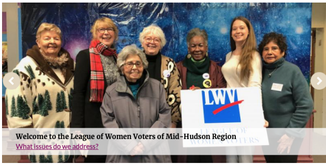
New LWVMHR Website