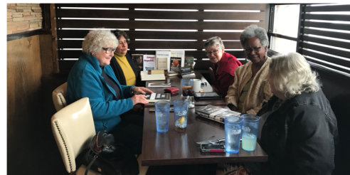
The Book Club meets

Although the Book Club no longer meets monthly since the pandemic, during the previous year it was very active. Members