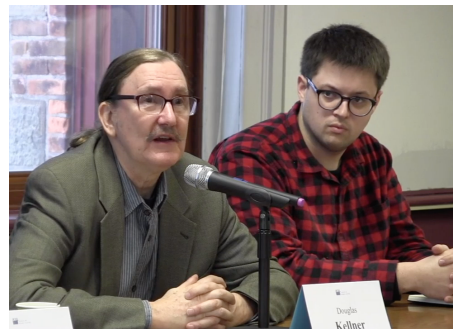
2 of 4 panelists on Election Security