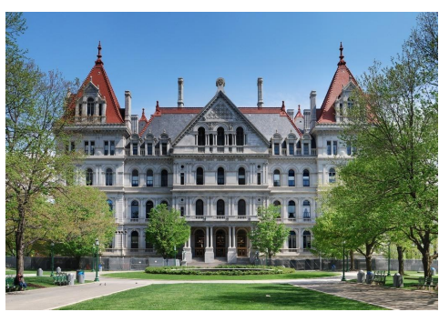
NYS Capitol