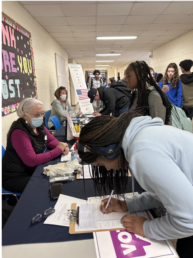
Minisink High School Voter Registration