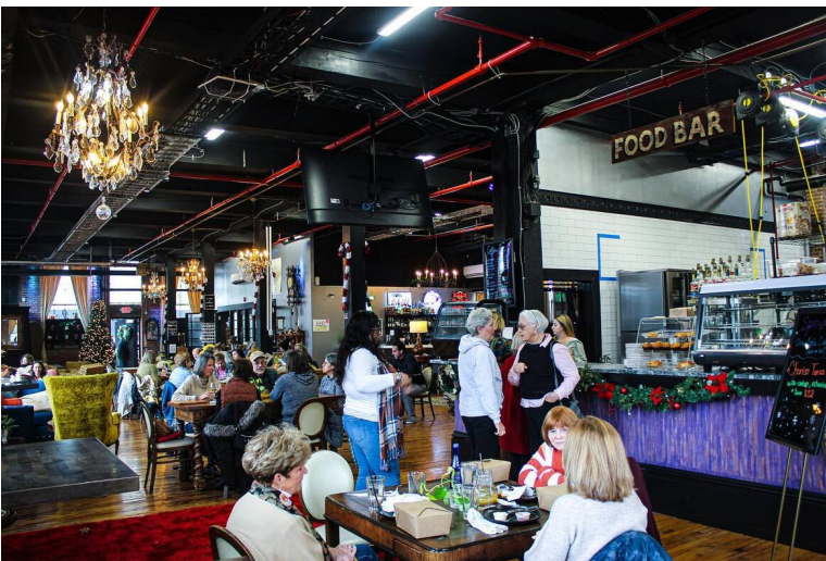
Silk Factory, Newburgh

Circle your calendar for January 20th, noon, at the Silk