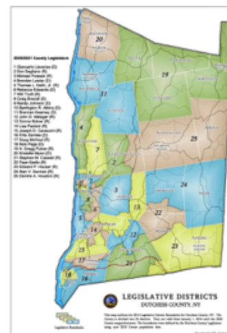
Dutchess County Legislature Districts

Ulster and the state have their commissions in place, ready to start work as soon as the census data comes down. Dutchess should have theirs in place soon. Now the job before us is to keep our eyes on these commissions and make sure they behave transparently and keep their own party biases out of the process. We all know how powerfully effective it is for bodies to know that we have our eyes on them!