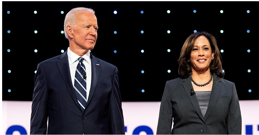
President Biden and Vice President Harris