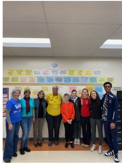
Tri-Valley High School