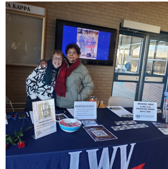
UCCC Stone Ridge