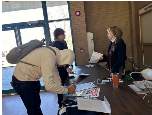
UCCC Stone Ridge