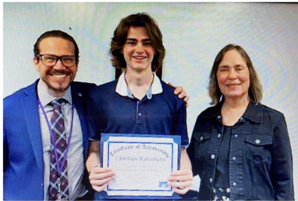
PhotoScan by Google Photos