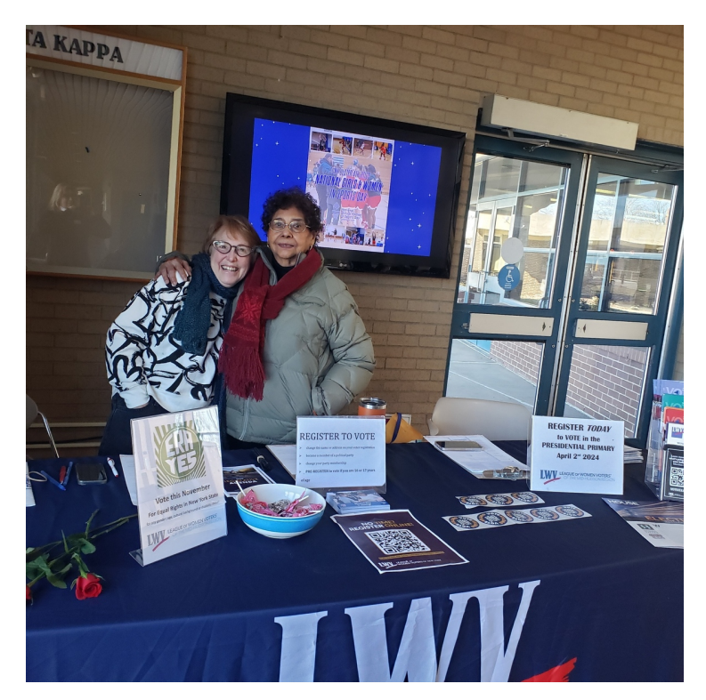
Pine Bush High School