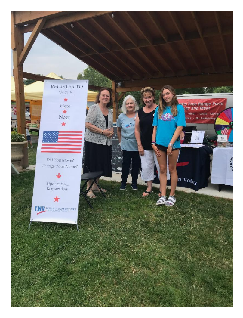
Get the most out of a Membership and Be Involved with Your Local League!

This section offers reports from ongoing groups and a Calendar to keep us connected: