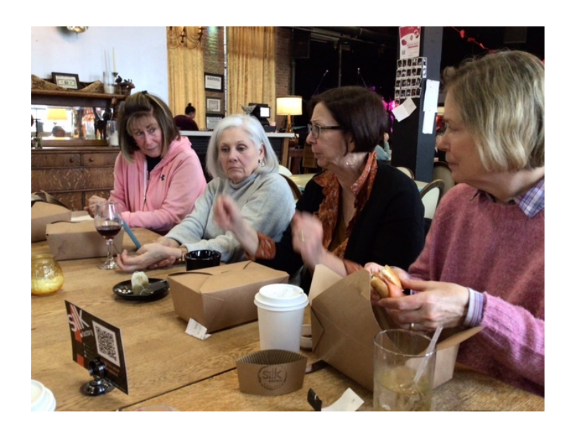
Regional Meetup Groups

The League still need to find members who can pop into the County Legislative Meetings in Orange & Ulster, as well!