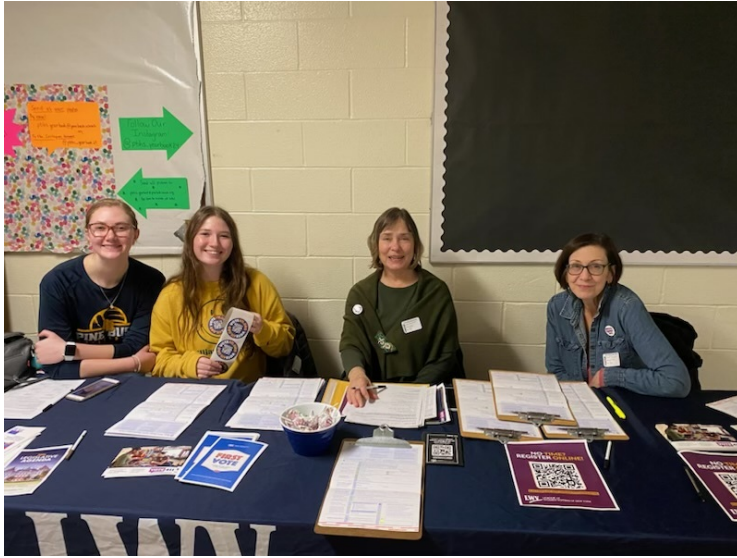
Pine Bush High School