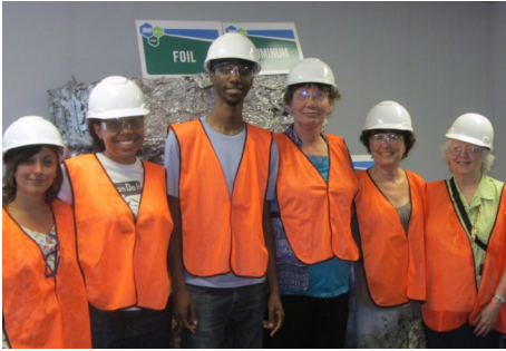
Committee members visit ReCommunity Beacon single- stream recycling facility